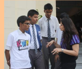
Panasonic Kids Witness News and Eco Picture Diaries

Kids Witness News held in 10 schools in Delhi and 300 Eco Picture Diaries distributed in Delhi-NCR