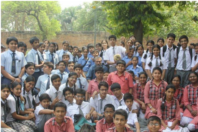
Different schools attended the Bird House Workshop at Qutub Minar from 18th April to 25th April 2012