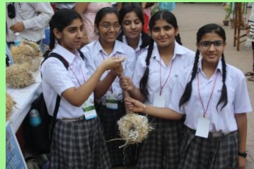
Environmental Workshops in over 200 Schools

Workshops include bird house making, water conservation, waste management and others. Held in schools like Mater Dei, Delhi Public School and others throughout the year.