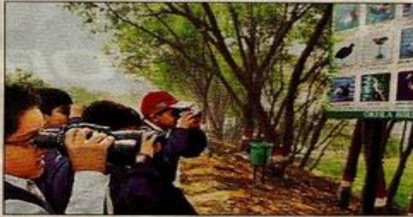
■ Children will be sensitized about ecology and wildlife during their day-long camp.