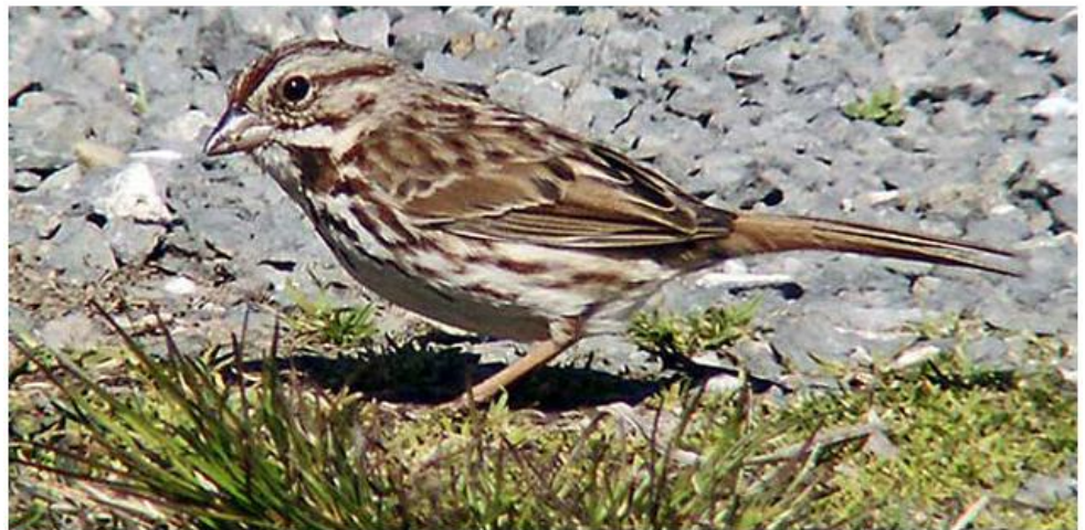
Kriti Bansal, Noida

April 2012- Civil Society magazine 'Save the Sparrow'