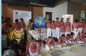
NDTV Tiger Telethon

Held at National Museum of Natural History, Delhi on 21 st July 2012