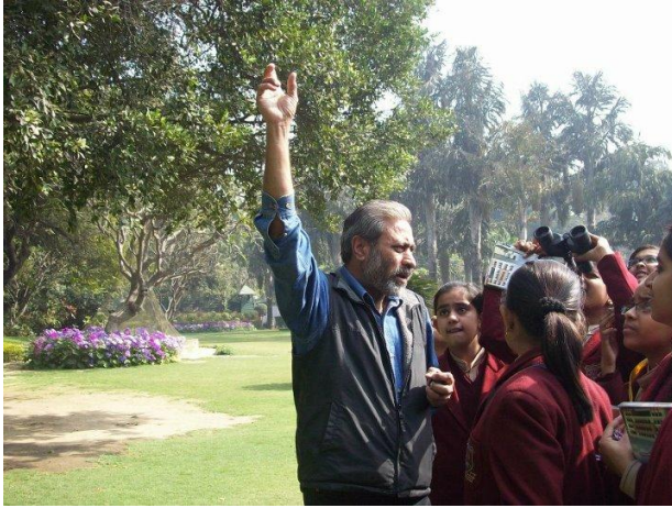
Nature Trail at Delhi CM House on February 2011